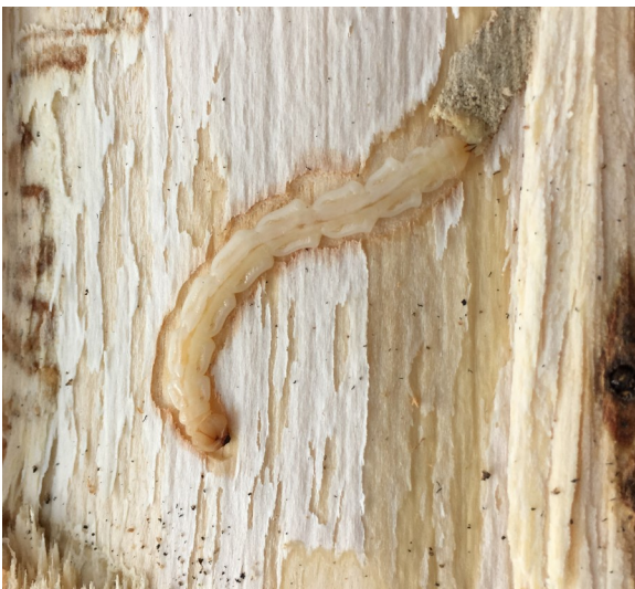
Larvae bore through the inner bark.

EAB is widespread in our region. It is known to be established in over 30 states, including New York, New Hampshire, and Massachusetts, and three Canadian provinces, including southern Quebec.