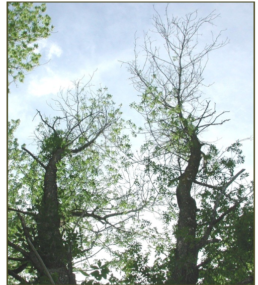
Infested trees die in 3 - 5 years.

Branches smaller than 1" in diameter can be infested. Branches, including those at the base of the canopy, are often infested first.